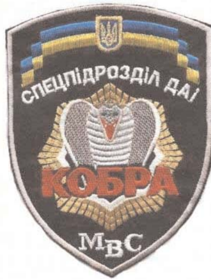
A patch for the Ukraine state police shows a cobra ready to strike as opposed to friendlier, more desirable community policing concepts and images.

visit from a delegation of officials from the Ukraine state police. They were interested in learning strategies for developing and improving relationships between their citizens and the police. As a part of the former Soviet Union, there is not much trust. Through an interpreter, I along with the other police officers working at PERF, tried to explain what community policing entailed. Afterwards, they gave me one of the patches from their Highway Enforcement Unit. Their insignia is a Cobra, coiled, with fangs exposed, and prepared to strike. That provided some insight into some of their problems in establishing relationships.