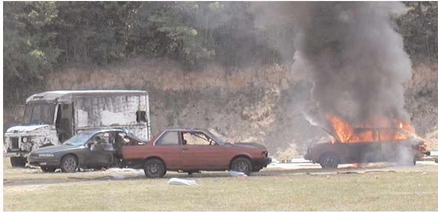
A car fire during the Large Vehicle Bomb Countermeasures class.

The course was vital in preparing for one of the worst challenges facing public safety agencies today, the Vehicle Bomb Improvised Explosive Device or VBIED. Widely used throughout