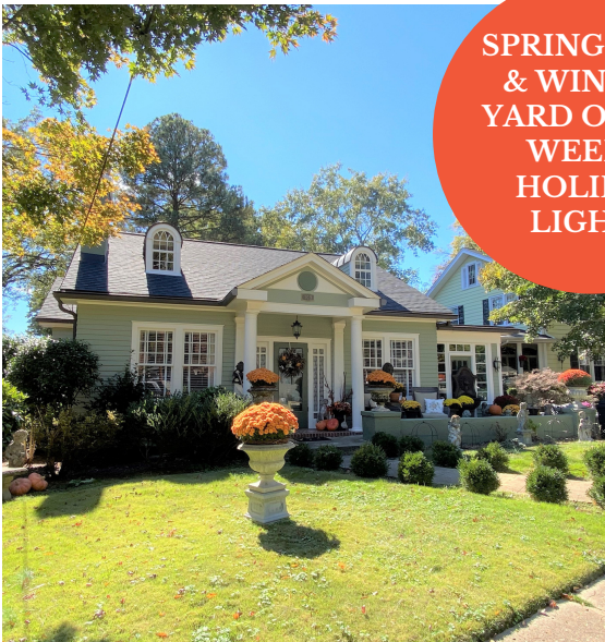
SPRING, FALL & WINTER YARD OF THE WEEK & HOLIDAY LIGHTS