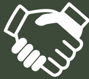
Trinity Hands 3,810 bags