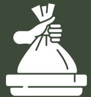
GAC 700 lbs trash/85 lbs of recyclables