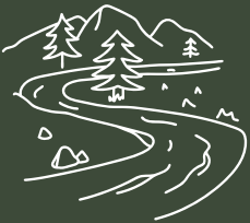
Litter Gitter 195 lbs.