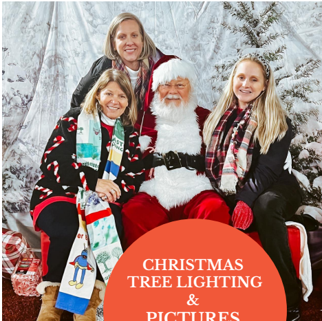
CHRISTMAS TREE LIGHTING & PICTURES WITH SANTA