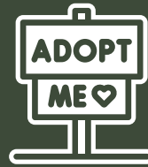
Adopt a Street 26 miles adopted