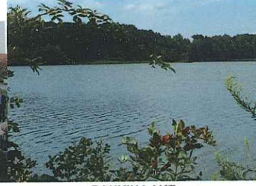
RANKIN LAKE Planned Improvements