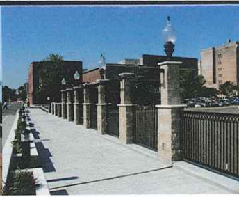
MARIETTA ST. BRIDGE Improvement