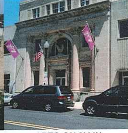
ARTS ON MAIN

City of Gastonia, North Carolina Annual Budget Fiscal Year 2011-2012