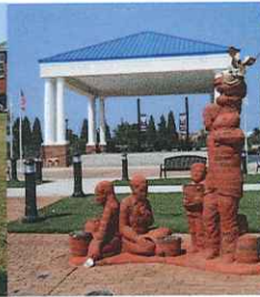
SOUTH ST. PLAZA