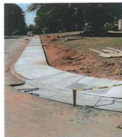
GO BOND Sidewalk Improvements