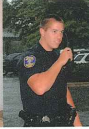
POLICE & FIRE 800MHZ SYSTEM