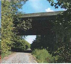
HIGHLAND RAIL TRAIL Development