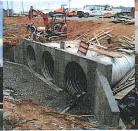
GASTON MALL Connector Road