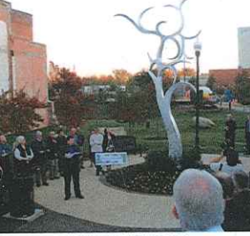
CENTER CITY PARK