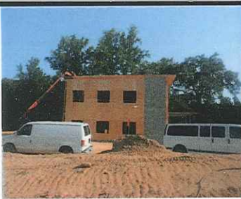
LEGACY CREDIT UNION New Construction