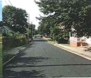
GO BOND Road Improvements