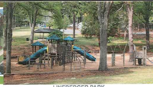
LINEBERGER PARK Improvements