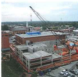
GASTONIA CONFERENCE CENTER