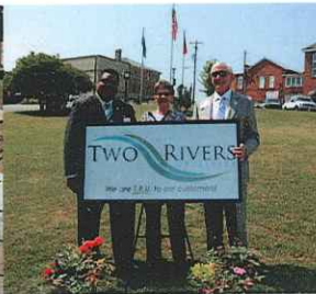
TWO RIVERS UTILITIES Agreement