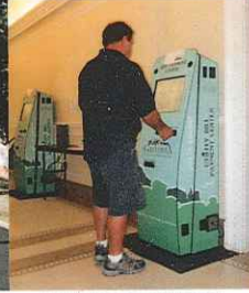
UTILITY PAYMENT KIOSKS