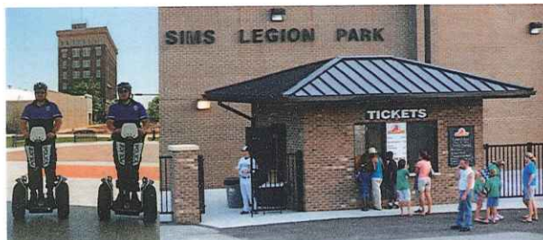
POLICE SEGWAYS Funded by EECBG