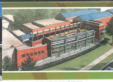
SCHIELE MUSEUM Planned Expansion