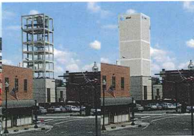
AT&T (TOWER ENCLOSURE) Before After