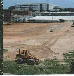
GROCERY STORE Site Development